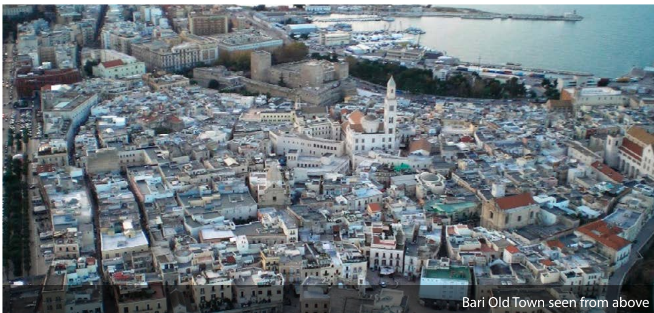
Bari Old Town seen from above